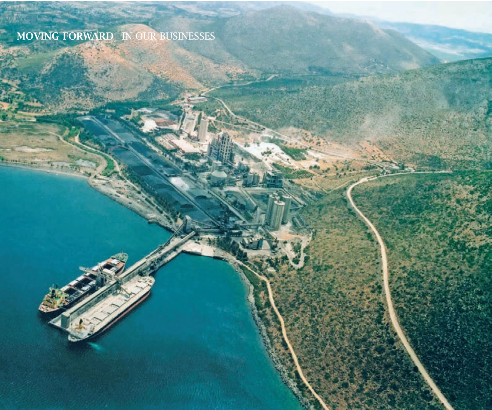
The Milaki cement plant in Greece uses industrial waste waters as an alternative to some raw materials of its cement production process.